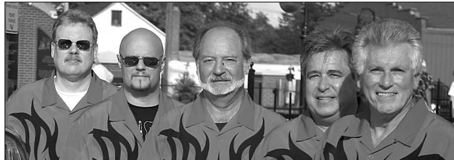
Golden Oldies experts Yesterday, a band featuring area residents playing classic tunes, wait to perform at the Knight B-4 event.