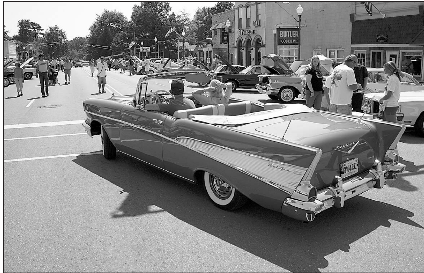
A Chevrolet Bel Air convertible pulls onto Main Street en route to a parking spot Saturday afternoon during the Cars of Summer show.