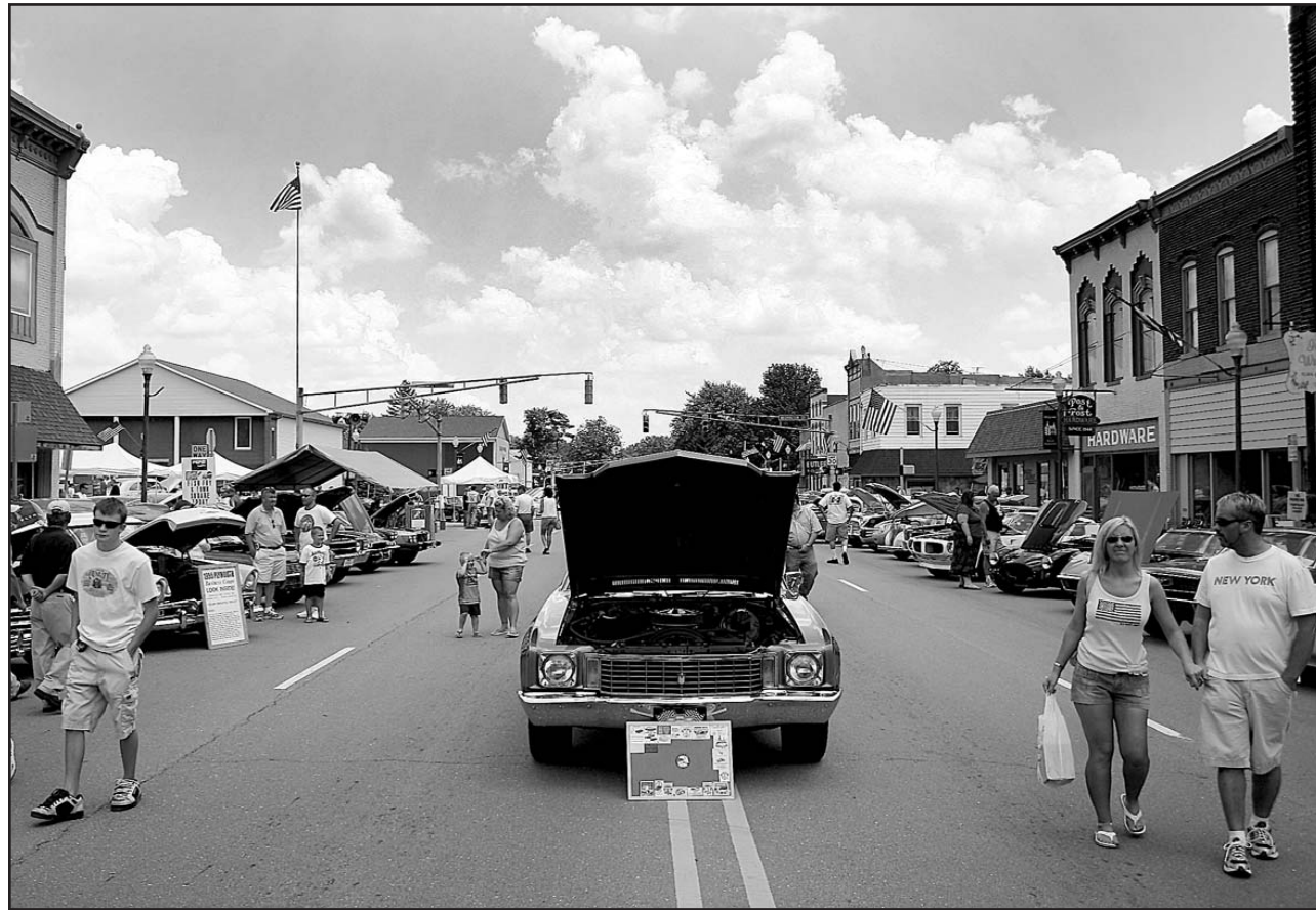
Cars and people line U.S. 40 and the Public Square in Knightstown Saturday for the car show.