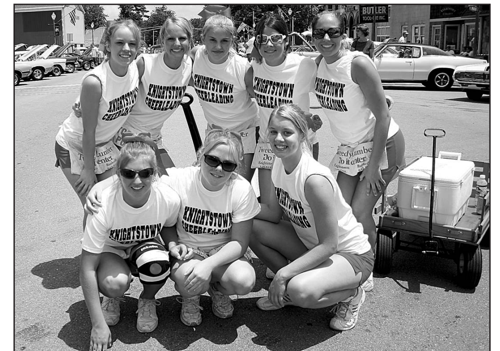
Members of the Knightstown High School varsity cheerleading team pose for a photo while selling ice cold water and 50/50 raffle tickets to car show goers.